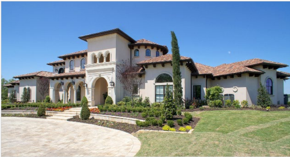
The Resort Blvd Home - Fort Worth, Texas